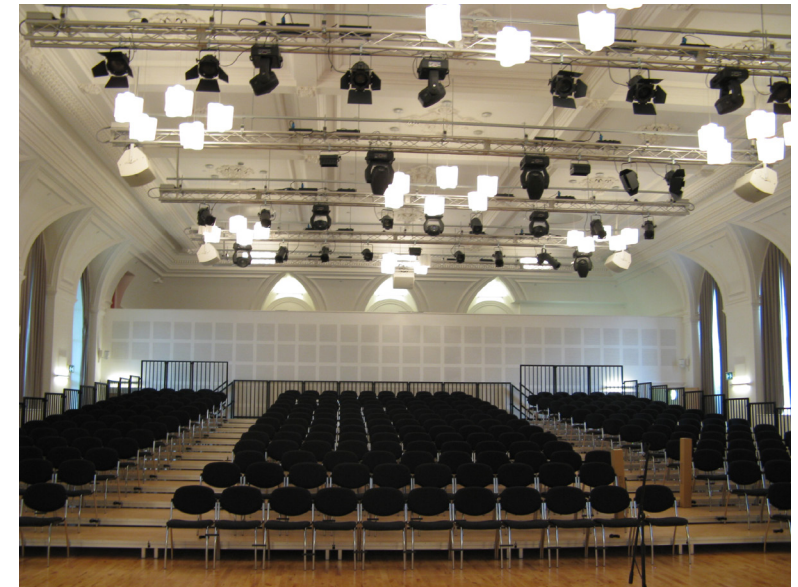
top left: the design box glazing / top right: substation public artwork / above: building plan / above right: the completed assembly room / right: mandela gardens water feature lighting / middle right: the grand entrance stair / far right: the design concept